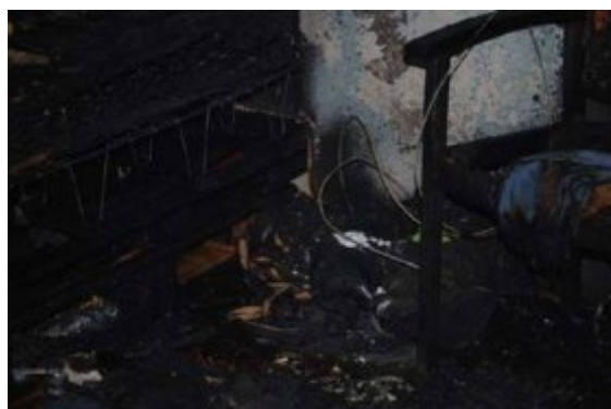
Residence Hall Fire Simulation