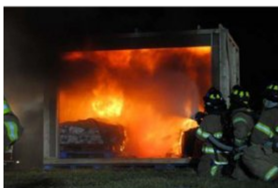
Residence Hall Fire Simulation