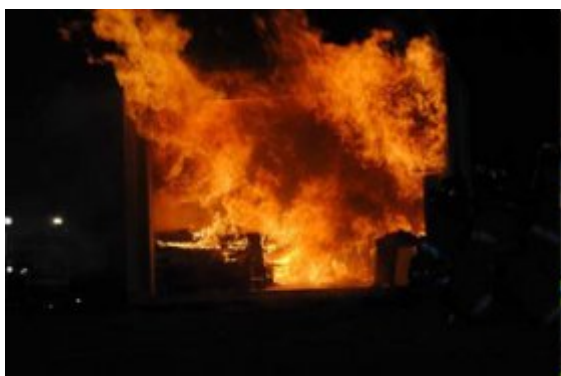
Residence Hall Fire Simulation