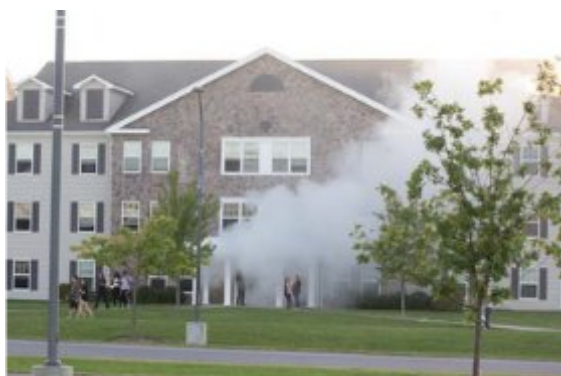
Students participating in the fire safety workshop

Included in the workshop is a residence hall fire simulation. The Residence Hall fire simulation will demonstrate the importance of Resident Hall fire safety evacuation training programs and will include the building being under full alarm, loss of power and lights, room and hall smoke generation and blocked egress routes. Multiple emergency response agencies and emergency management teams will participate in this controlled building evacuation exercise.