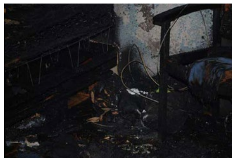
Residence Hall Fire Simulation