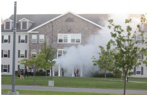
Students participating in the fire safety workshop

Included in the workshop is a residence hall fire simulation. The Residence Hall fire simulation will demonstrate the importance of Resident Hall fire safety evacuation training programs and will include the building being under full alarm, loss of power and lights, room and hall smoke generation and blocked egress routes. Multiple emergency response agencies and emergency management teams will participate in this controlled building evacuation exercise.