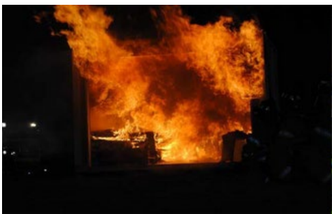
Residence Hall Fire Simulation