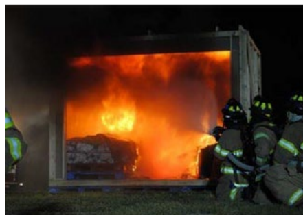
Residence Hall Fire Simulation